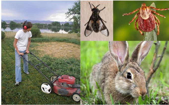
Figure 2. Possible exposures for Tularemia