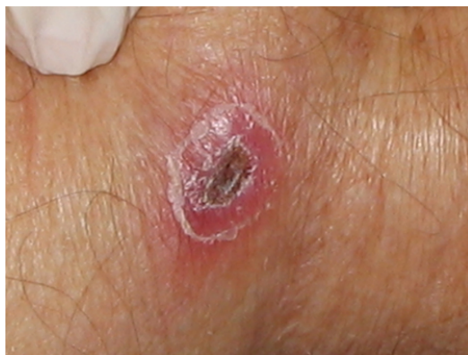
Figure 1. Tularemia Eschar

Ulceroglandular disease is the most common form of tularemia, and it is the clinical form most easily recognized as tularemia. Patients with ulceroglandular disease usually report recent animal contact, or exposure to potential insect vectors (particularly ticks).